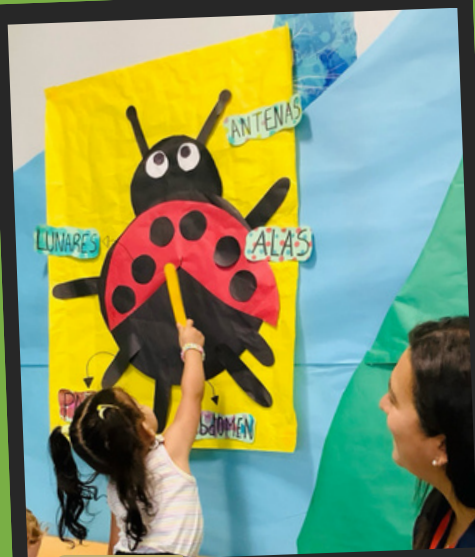
BODY PARTS ANALYSIS