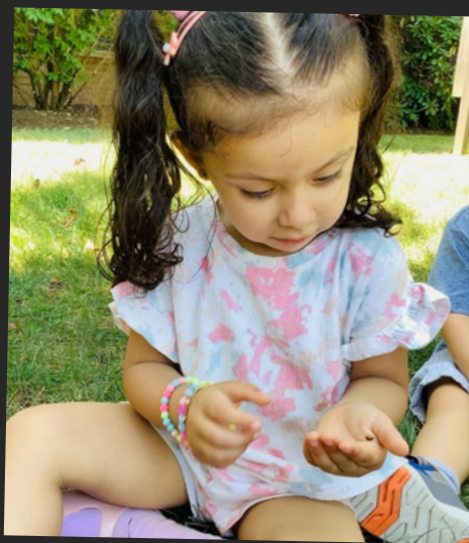
INTERACTION WITH THE INSECT